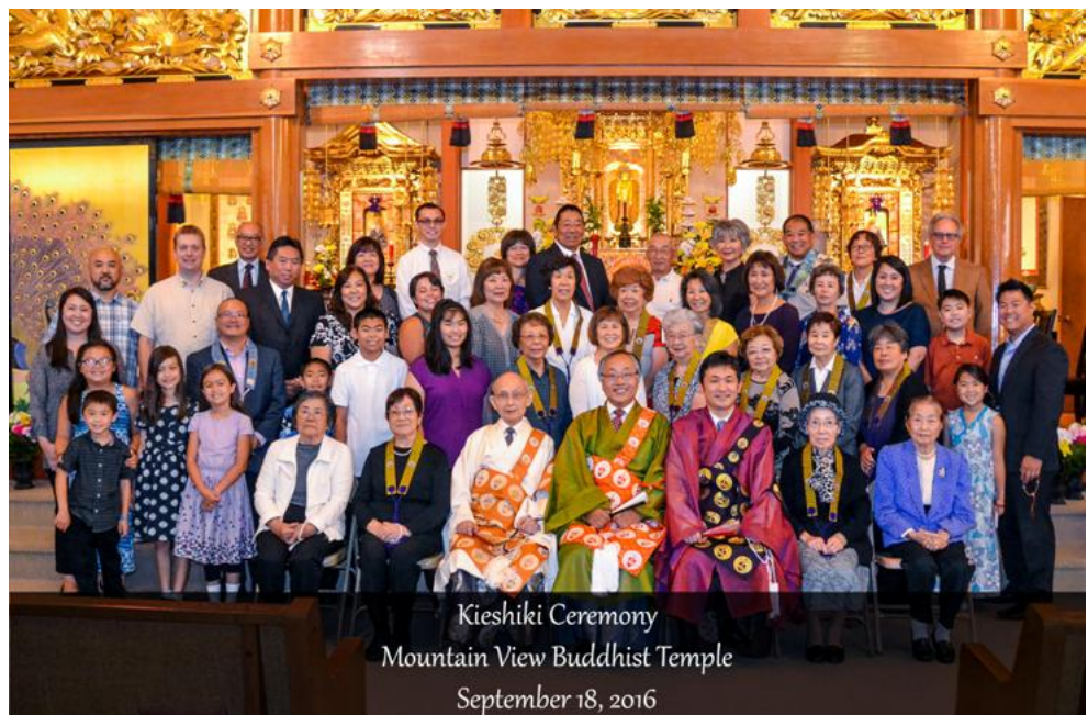
Kieshiki Ceremony Mountain View Buddhist Temple September 18, 2016