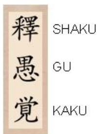
True Disciple of Buddha