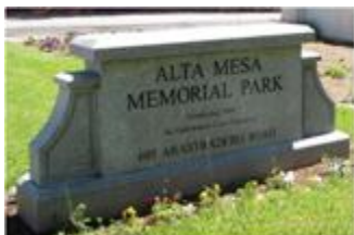
Final resting place of many Temple members and friends. Also, Steve Jobs, David Packard & Tennessee Ernie Ford.